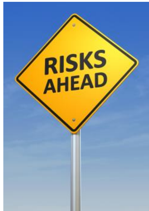
Loss aversion bias